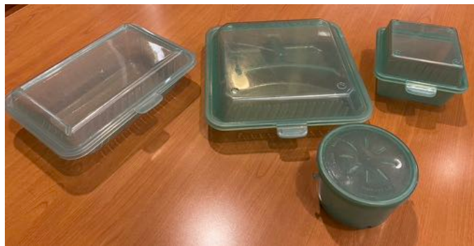
Green To Go Containers

residents in following the new system and answer their questions and concerns. We kindly asked all residents to leave any resident-owned containers outside the Dining Room.